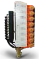
Highly efficient water distributors

Saving potential: Energy savings of 62 % on average and up to 92 % compared to conventional designs.