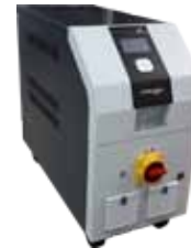
Highly efficient temperature control units